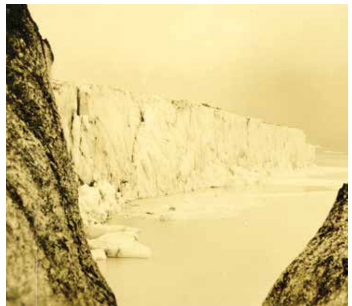
View of a glacier in Iceland, 1943.