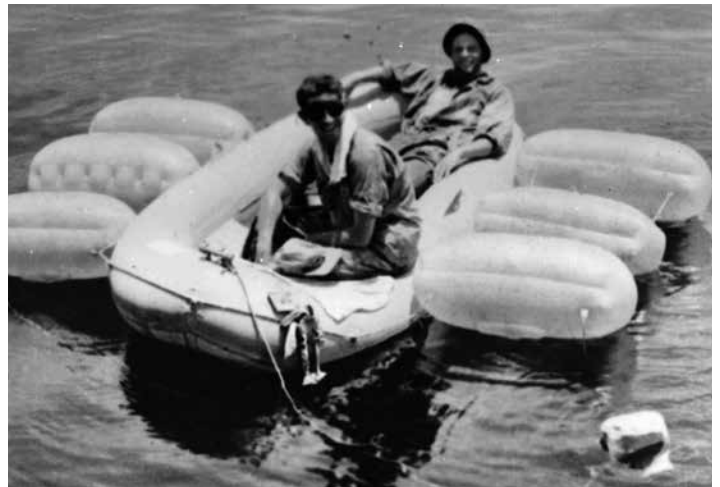
Two servicemen sitting in a raft on water, with emergency solar stills floating over the side.

Your teacher will give you the materials to construct the device.